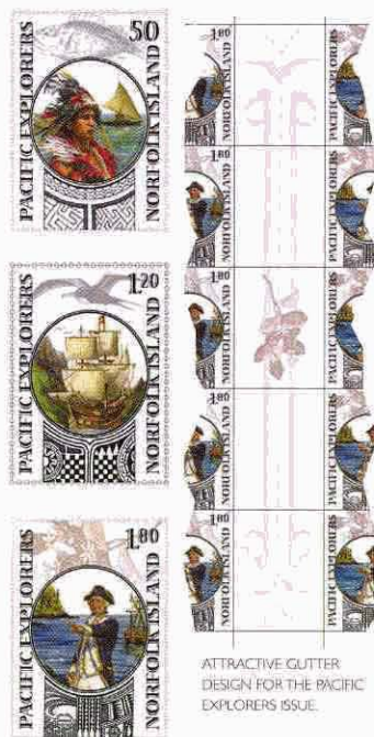
ATTRACTIVE GUTTER DESIGN FOR THE PACIFIC EXPLORERS ISSUE.

Printer: Southern Colour Print, New Zealand Gutter: Image in Gutter Prod. Qty: 30,000 sets, 10,000 m/s Layout: Sheets of 50 in 2 panes of 25 stamps