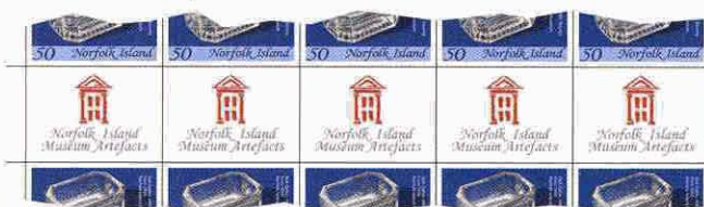
GUTTER DESIGN FOR THE MUSEUM ISSUE: SEE THE PREVIOUS BULLETIN FOR FULL STAMP DETAILS.