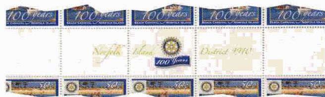
GUTTER DESIGN FOR THE ROTARY ISSUE: SEE THE PREVIOUS BULLETIN FOR FULL STAMP & MINISHEET DETAILS.

Prod. Qty: 30,000 sets (stamps) 10,000 (minisheets)