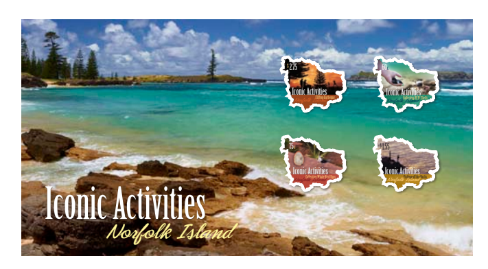
First Day Cover illustration