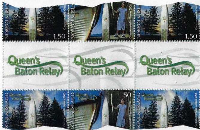
THE GUTTER STRIP INCORPORATES THE OFFICIAL QUEEN'S BATON RELAY LOGO

Issue date: 16th January 2006 Value: 50 cents & $1.50 F.D.Cover: Value$2.50 Designer: Mary Butterfield, Norfolk Island Printer: Southern Colour Print, NZ Sheet Layout: 2 panes of 24 stamps (12Setenant Pairs) per sheet. Print Quantity: 30,000 sets